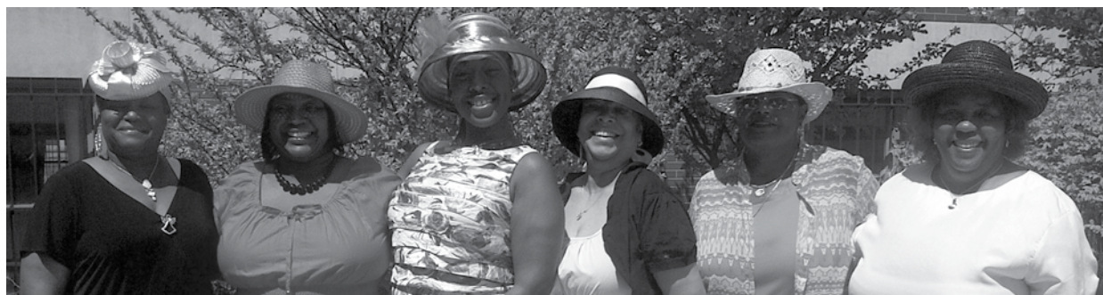
Deborah's Place peer leaders, the DP Divas, at a tea party they hosted in appreciation and support of their fellow tenants.